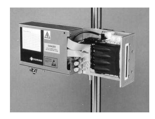
Figure 6. Domino G7000 Unit showing Xaar XJ500 Printhead

The product is fully networked. A single PC based controller can control up to 30 printers through RS485 and connect to Ethernet or other factory networks as required. The basic label design can be done on the controller in a user-friendly Windows environment. The labels are then stored in the G700 printers which can separately inject product-by-product variability such as times, dates and serial numbers into the label in alphanumeric or barcode format. The printers can also