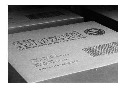
Figure 5. Barcode and graphics on the Secondary Carton