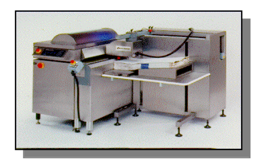
Figure 3. Domino Packtrack Mimeographic Printer

In many ways this appears to be the ideal positioning and it was here that Domino introduced its Packtrack mimeographic printer in 1993. (figure 3) This variable contact printer gave large very high quality images which could be varied in less than one minute. It did not allow variation from box to box but was ideally suited to print short runs. The product was only a moderate success, however because factory managers resisted the idea of introducing an extra stage into their production process. Rightly or wrongly the extra complication this caused was seen to outweigh the benefits of reduced carton stocks.