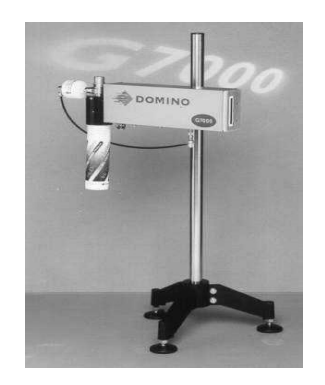
Figure 4. Domino G7000 showing electronics unit and pressurised ink container

This provides good quality graphics as well as fullspecification bar codes (figure 5) with sufficient resolution to cope with different porosities of board by fractionally adjusting the width of bar codes to compensate for any spreading of the ink. Using black pigmented ink this printer meets the requirements of the most demanding users such as the high-density distribution hubs of the large European retailers.